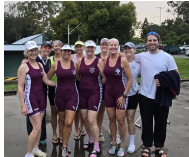
2026 QLD Masters 8+

Some very early starts for these Noosa rowers