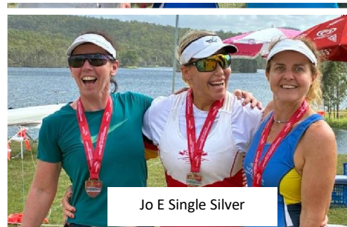
Jo E Single Silver